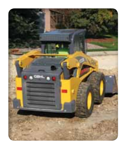
HEAVY-DUTY CHASSIS provides excellent weight distribution, enhancing machine stability. A rear bumper and counterweight on the model V330 adds protection and towing capability.