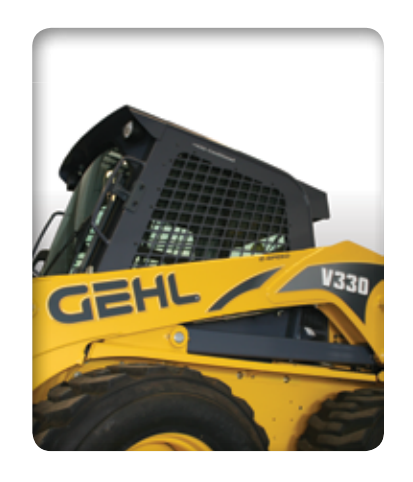
the sides, rear and front is achieved with a unique, low-profile boom design. A roof window allows the operator to view the lift arm when in the fully raised position.