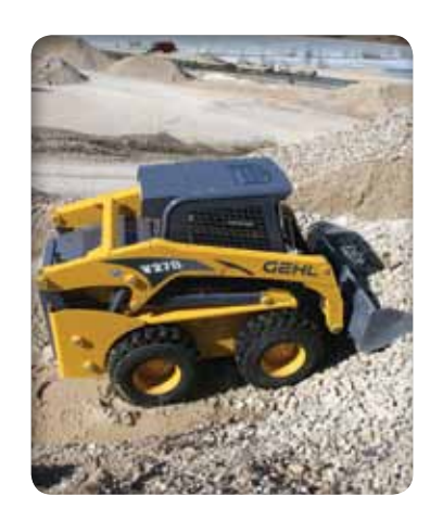
extra Long wheelbase of up to 55 inches (1387 mm) enhances machine stability when lifting and loading and provides a smoother ride over rough terrain.