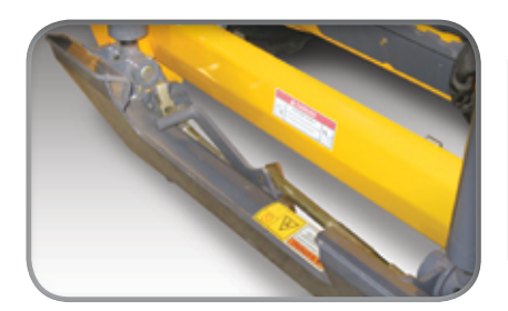
ALL-TACH® SYSTEM All models feature the easy-to-use All-Tach® (universal-style) attachment mounting system compatible with most allied attachments.

Time is priceless no matter where your machine goes, so Gehl has made it simple and fast to hook-up a wide variety of available attachments.