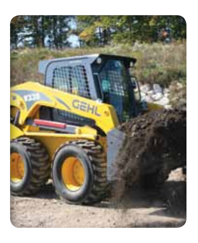
SHIFT INTO HIGH GEAR with standard two speed "soft-shift" drive on the V270 and V330, providing speeds over 12 mph (19 km/hr)* with smooth transitions between gears. * Travel speed on model V330