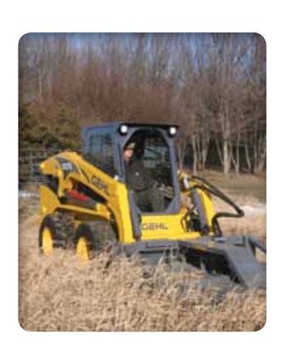
AUXILIARY HYDRAULICS are standard, powering many attachments. Optional high flow increases their capability. Dependent on control pattern, a rocker switch or foot pedal provides electronic proportional flow control.